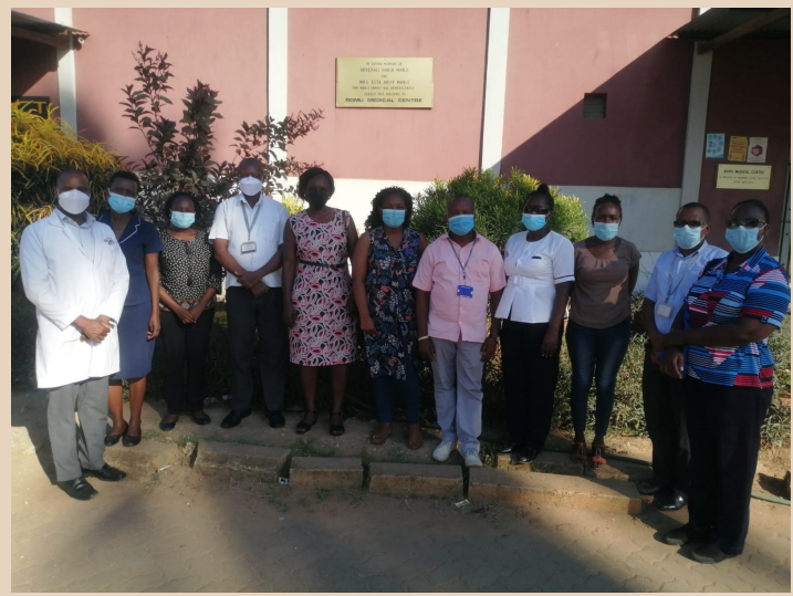
At Bomu Medical Centre Likoni

At the end of the audit, the auditors noted that Bomu is a center of excellence and will be a reference point for other institutions to learn from.