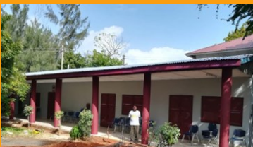
Bomu Medical Centre Timboni