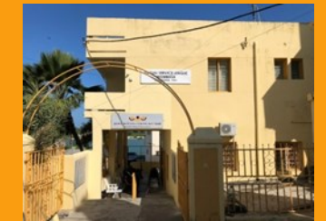
Bomu Medical Centre Old Town