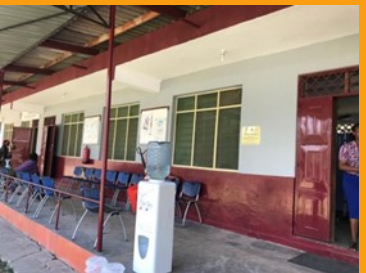
Bomu Medical Centre Wema