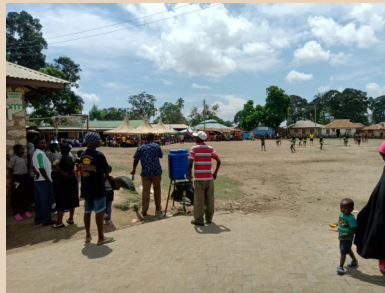
Bomu Hospital Community Health Volunteers at the forefront during the World AIDS Day procession.