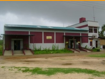
Bomu Medical Centre Likoni