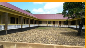
Bomu Medical Centre Al-Walidayn