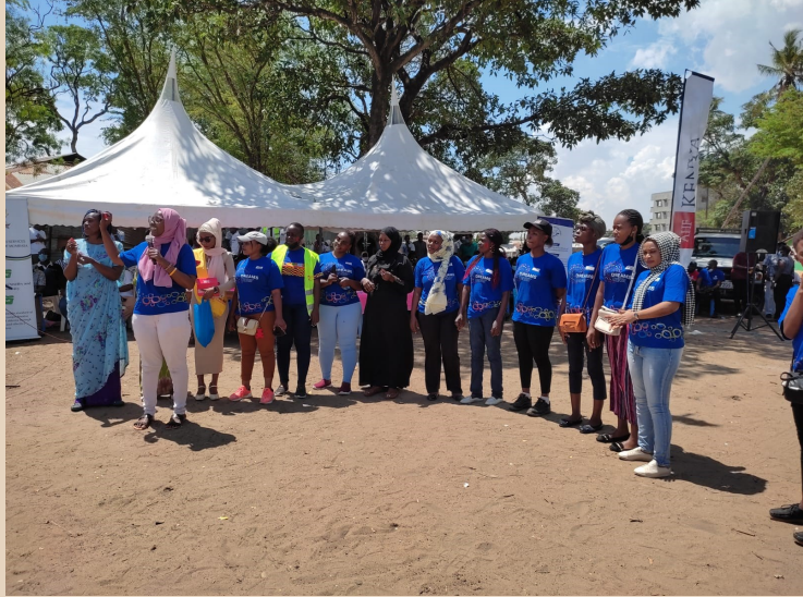
DREAMS AGYW giving a health talk on condom use at World AIDS day in Kisauni