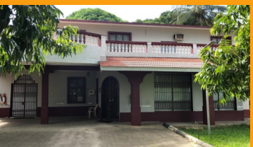
Bomu Archives - Tudor