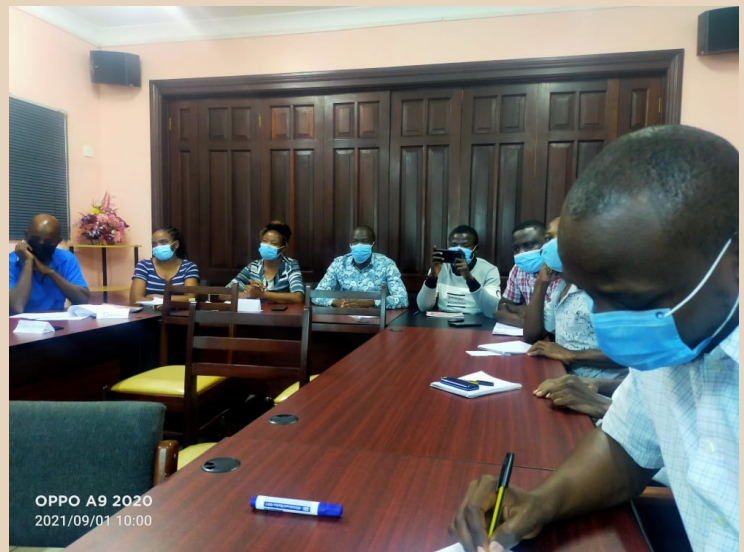
Laboratory Strengthening Training