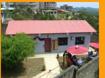
Bomu Mikindani Sewing Center