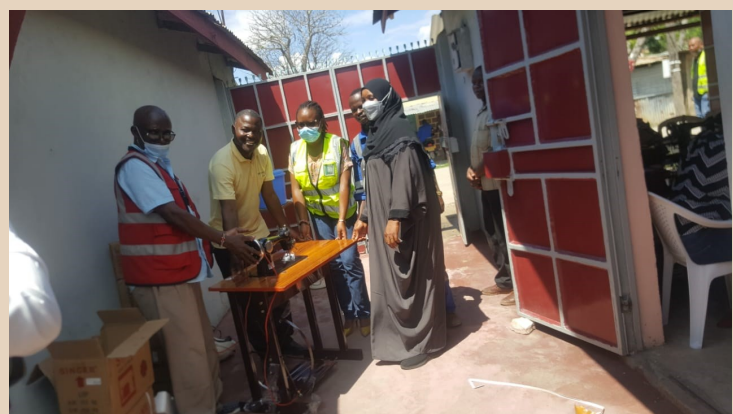
DREAMS Program Coordinator receiving 10 sewing machines from Fujita Corporation Company for the DREAMS Vocational Training at Miritini site

The Smile Train program generously donated cleft lip and palate sets for use in theatre.