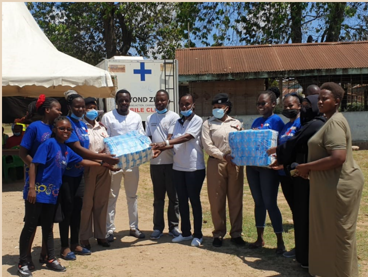
Mtopanga/Shanzu/Bamburi DREAMS AGYW received Dignity Packs from Stretchers (NGO) during World AIDS day at Kisauni