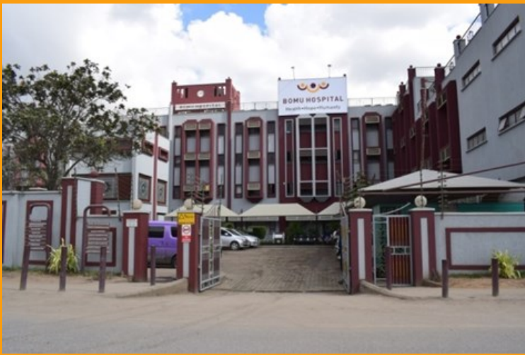
Bomu Hospital Changamwe