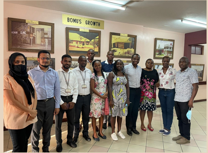
At Bomu Hospital Changamwe

Bomu Hospital has always been an active participant during the pre-World AIDS Day and the World AIDS Day.