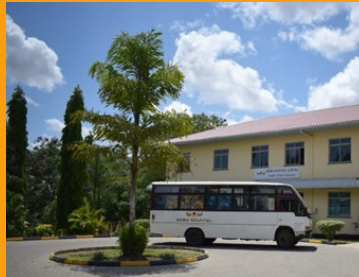
Bomu Medical Centre Mariakani